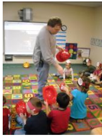
LEFT: Stop, drop and roll!