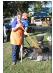
The chili cook-off was a big draw at this year's festival.