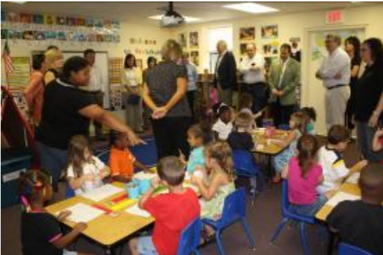
Child Watch Tour participants observe a Little Dixie Head Start classroom in Hugo.