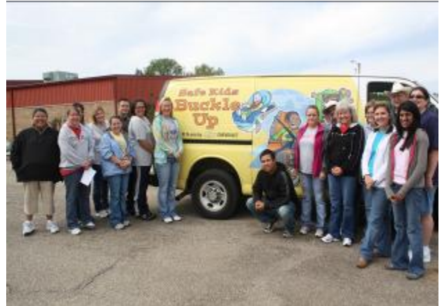
Oklahoma State Department of Health, Little Dixie Transit, Choctaw Nation and local Turning Point coalitions participated in car seat safety training and inspections recently in Hugo.

The event was held at Hugo Agriplex and hosted by Oklahoma State Department of Health. Several local motorists came through the inspection line and received information about car seat safety and proper usage.