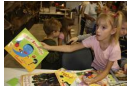
Hundreds of books were given out at the Deer festival thanks to Smart Start Tri-County.