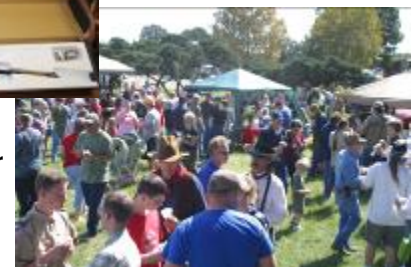
The Antlers Deer Festival crowd.