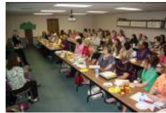
Nearly 100 educators gathered at Horace Mann Head Start in Hugo for the team meeting.