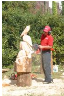
Chainsaw carving at the Antlers Deer Festival.